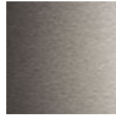
satine stainless steel