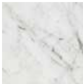
BCO matt white Carrara